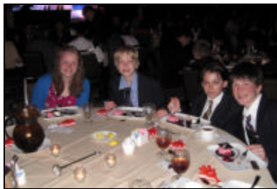
Montana Team at National Banquet

As national champion, the middle schooler walked away with an $8,000 scholarship and a trip to US Space Camp in Huntsville, Alabama. He also earned an $8,000 scholarship as the winner of the written round.