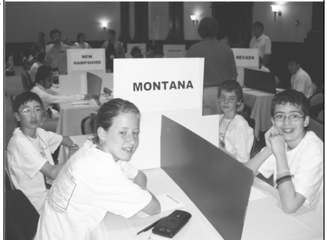
The Montana MATHCOUNTS Team pose before taking their tests at the National Competition in Fort Worth, Texas.

generation of successful engineers. Thanks for helping make a difference.